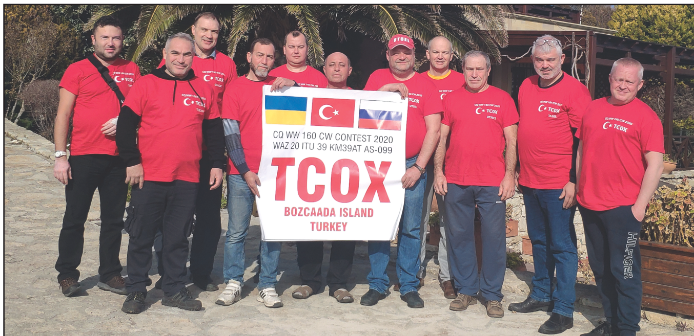
Multi-Op Asia winner is the crew from Ukraine and Turkey of (not listed in standing order) TA3A, TA3AER, TA3EL, TA3LHH, UA9CDC, URØMC, US2YW, UT5ECZ, UT5EL, UW8SM, and UZ5DX.