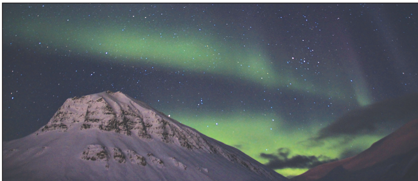
Why did K1ZM work only 50 stations from JW? Check out the beautiful aurora in the night sky. Great for tourists, not so great for radio.

In Europe's Zone 14, DJ7WW reported good conditions only the first night. With only four scores over 100K, one of them was made by TM6M in Low Power.