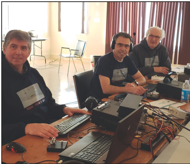
The team at VO2AC, which placed #9 in the Multi-Op World category, included (from l. to r.) VE9CB, VO2AC, and VO1HP.

A pattern has been emerging over the past few years. The 160-meter band is a great DX band during the solar minimum.