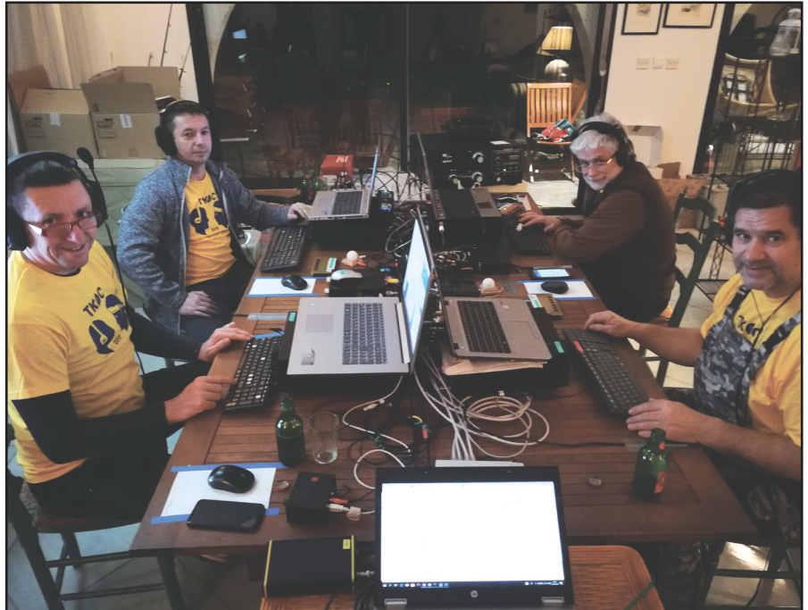
TKØC took first place in CW Multi-Op in the world. The team was comprised of S57AL, S53F, S53RM, and S57C.